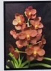
Asoda Ben's Delight 'Coffee'