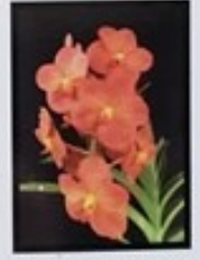
Asoda Ben's Delight # 13