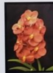
Asoda Ben's Delight # 18

17720 S.W. 218 Street • Miami, FL 33170 Tel: 305-247-8854 • Fax: 786-243-1899 Email: banjong_orchids@hotmail.com