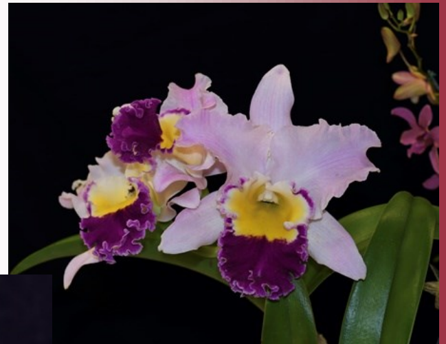
Red Ribbon Rlc. Beauty Girl Peg Geria