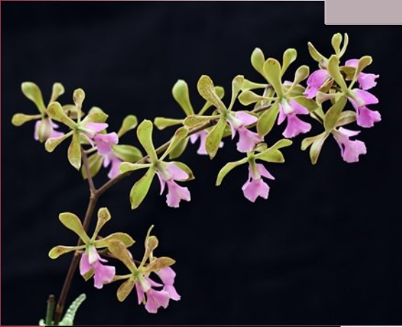
Blue Ribbon Epy. Serena O'Neill Phyllis Durst