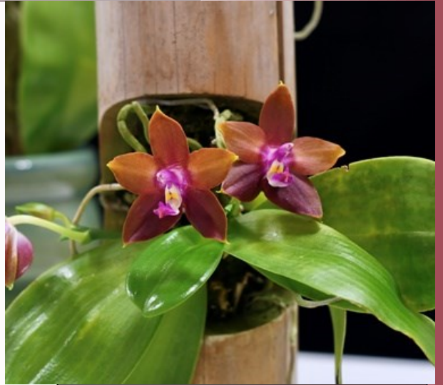
Blue Ribbon Phal. Pylo's Sensation 'Jess' AM/AOS Gigi Louis