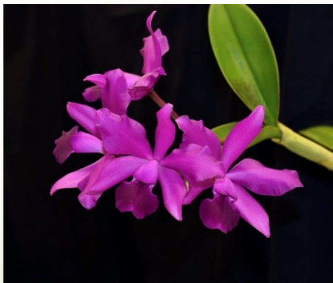
Red Ribbon Bc. Jose's Sugar Plum Rho De Borja

As a reminder, all plants brought in for the show table should be free of pests and diseases. Take some time to stake and clean the leaves of your plants, this allows for better presentation. Also, please do not bring newly-purchased plants for the show table.