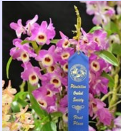
Blue Ribbon Den. Country Girl 'Warabeuta' Carol Schwimmer