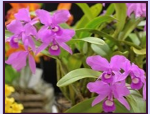
Blue Ribbon Gur. skinneri Phyllis Durst

As a reminder, all plants brought in for the show table should be free of pests and diseases. Take some time to stake and clean the leaves of your plants, this allows for better presentation. Also, please do not bring newly-purchased plants for the show table.