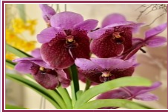
Blue Ribbon V. Taweesuks x sanderiana Michelle