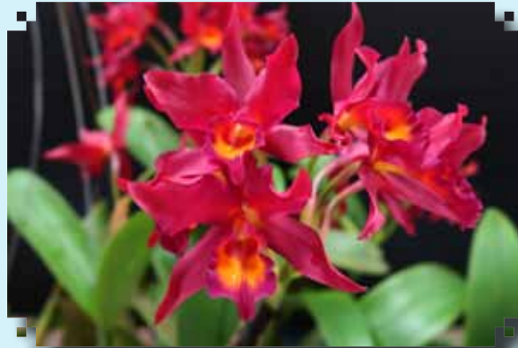
YELLOW/BLUE RIBBON C. War Paint Lynn Molitor