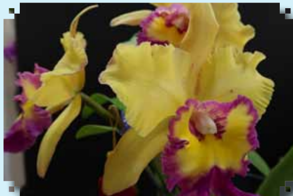
RED RIBBON Blc. Young Kong 'Sun No. 16' Phyllis Durst