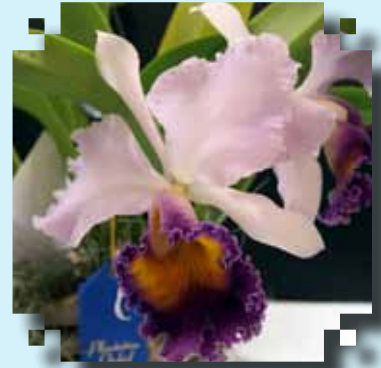
BLUE RIBBON C. Dinard 'Blue Heaven' Peggy Geria