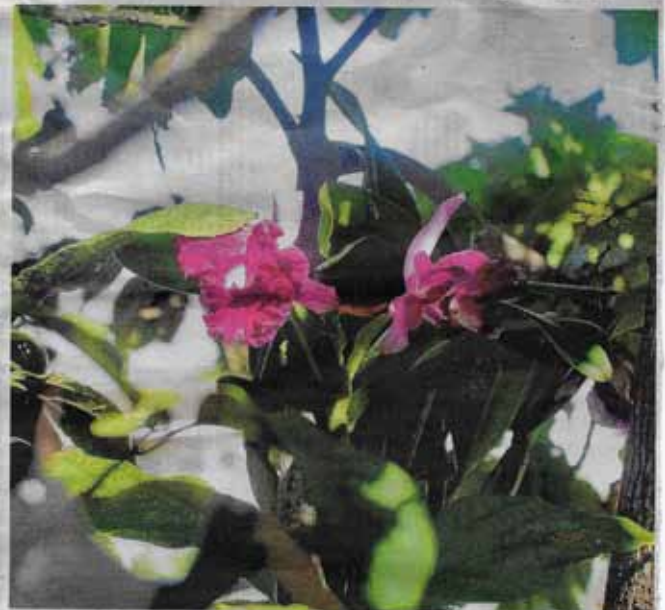
IN BLOOM The Plantation Orchid Society holds competitions and participates in neighboring shows.