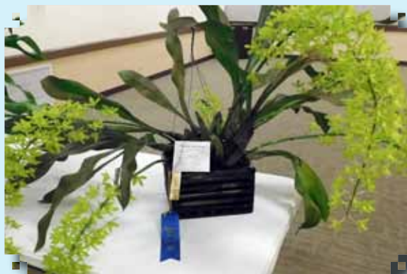
BLUE RIBBON Gram. scriptum var. citrinum 'Hihimau' Dot McCrain