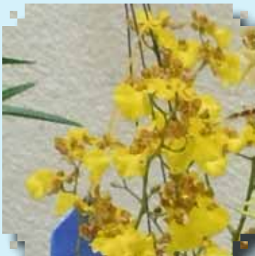
BLUE RIBBON Onc. Juhboa Gold Jeff Tucker