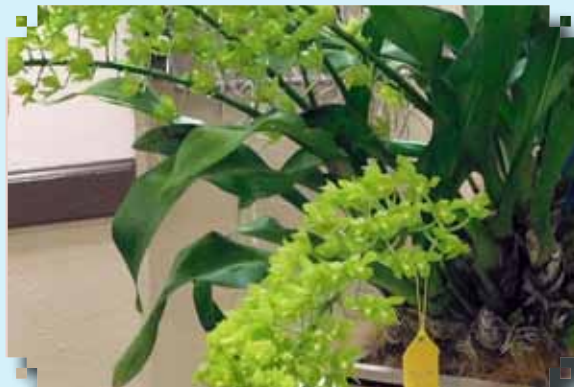
YELLOW CULTURE RIBBON Gram. citrinum Paul & Francisco