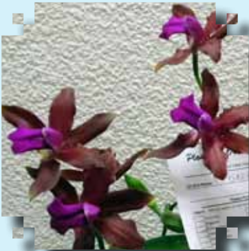
GREEN RIBBON (species) C. bicolor Gigi Louis