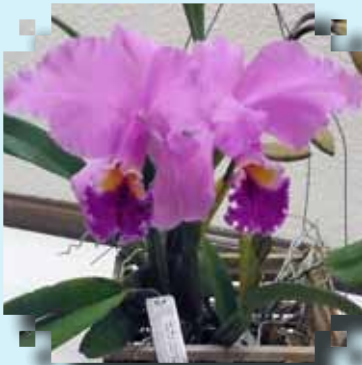
YELLOW RIBBON Blc. Cornerstone 4th of July Peg Geria