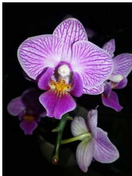
Our 2015 Photo Winner - Jill Greenbaum

Everyone renewing by June will receive a Plant at the June meeting!