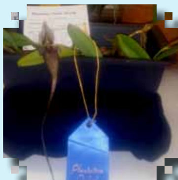
BLUE RIBBON Bulb. Fascinator V. Hampeliana Gigi Louis