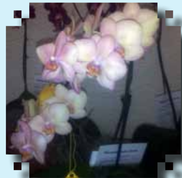
YELLOW RIBBON Phal. Sunset Cloud Phyllis Durst