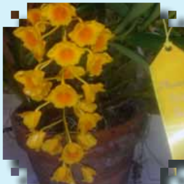
YELLOW RIBBON Den. Crysotoxum Rose Maytin