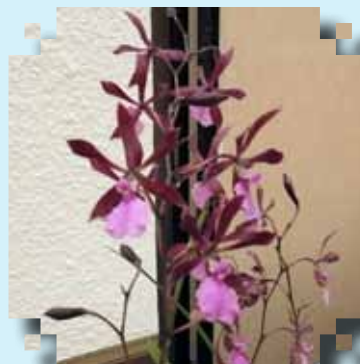
BLUE RIBBON Enc. Alanta x Enc. Tampensis Phyllis Durst