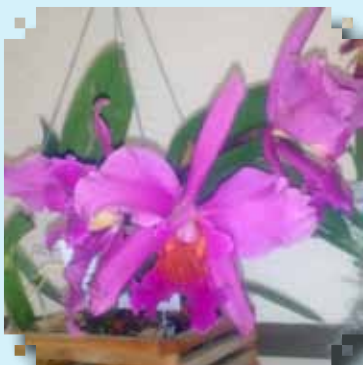
YELLOW RIBBON Rlc. Little Mike X American Velvet X Royal Reason Peg Geria