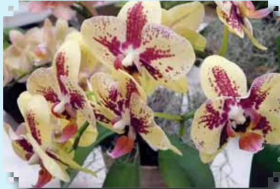
YELLOW/BLUE RIBBON Dtps. KV Charmer '802' Phyllis Durst