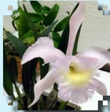
RED RIBBON Bc. Frill Seeker Karen Reynoldson

As a reminder, all plants brought in for the show table should be free of pests and diseases. Take some time to stake and clean the leaves of your plants, this allows for better presentation. Also, please do not bring newly-purchased plants for the show table. The show table is an outlet for members to share the great job they have done in growing and flowering their orchids; therefore, please respect the unwritten rule of owning and growing an orchid for a minimum of 6 months.