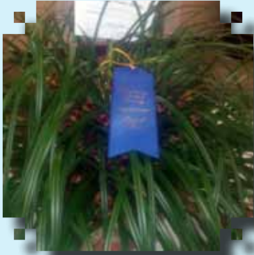
BLUE RIBBON maxillaria tenuifolia Lenide Pierre-Antoine