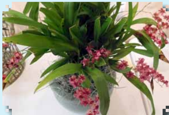
RED RIBBON Onc. Twinkle 'Red' Sue Dohn