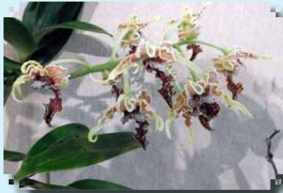
BLUE RIBBON Den. Spectabile Papua New Guinea Species Lynn Molitor