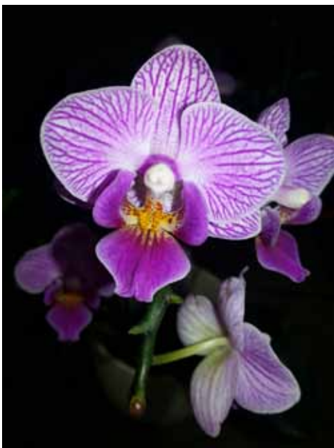
Our 2015 Photo Winner - Jill Greenbaum

Voice Mail (305) 667-2992 Web site is http://orchidmaniafl.org/