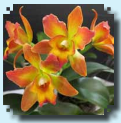
RED RIBBON Blc. Cumberland Beauty Regal Jewels Lenide Pierre-Antoine