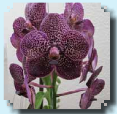
RED RIBBON Ascda. Kulvadee Mary Lee Tabeling

As a reminder, all plants brought in for the show table should be free of pests and diseases. Take some time to stake and clean the leaves of your plants, this allows for better presentation. Also, please do not bring newly-purchased plants for the show table. The show table is an outlet for members to share the great job they have done in growing and flowering their orchids; therefore, please respect the unwritten rule of owning and growing an orchid for a minimum of 6 months.