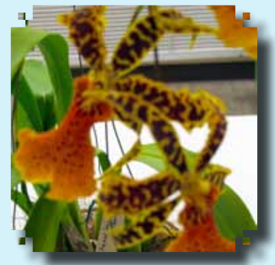
RED RIBBON Alcrd. Hilo Ablaze 'Hilo Gold' HCC/AOS Phyllis Durst