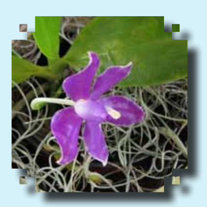
BLUE RIBBON Phal. Lenddenuriana Suzi Bleus