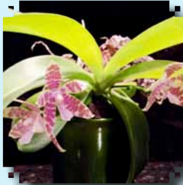
BLUE RIBBON Phal. Hieroglyphica Gigi Louis