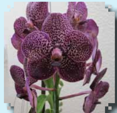
RED RIBBON Ascda. Kulvadee Mary Lee Tabeling

As a reminder, all plants brought in for the show table should be free of pests and diseases. Take some time to stake and clean the leaves of your plants, this allows for better presentation. Also, please do not bring newly-purchased plants for the show table. The show table is an outlet for members to share the great job they have done in growing and flowering their orchids; therefore, please respect the unwritten rule of owning and growing an orchid for a minimum of 6 months.