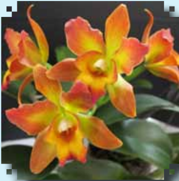
RED RIBBON Blc. Cumberland Beauty Regal Jewels Lenide Pierre-Antoine