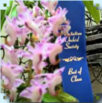
BLUE RIBBON Aerides lawrenceae Lynn Molitor