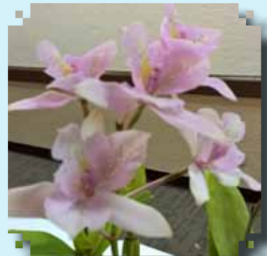
BLUE RIBBON Caulocattleya Chantilly Lace "Twinkle" Helene Albee