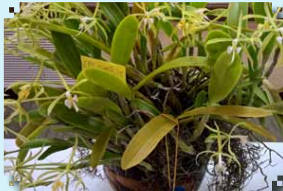
BLUE RIBBON Epi. oerstedii Mireille Jeannopoulos