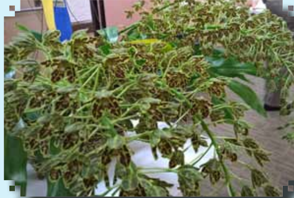
YELLOW/BLUE RIBBON Grammatophyllum scriptum "Grasshopper" Michele Boland