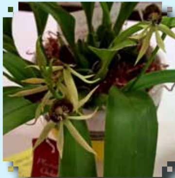
RED RIBBON Epi Green Hornet (cochleatum "spy hill" X anciflorium) Elise Chapman