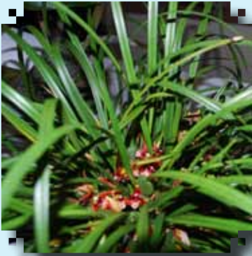
BLUE RIBBON Maxillaria tenuifolia Lenide Pierre-Antoine