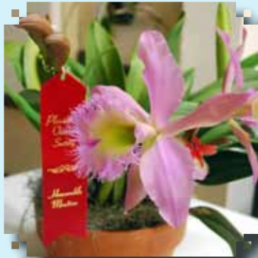
RED RIBBON BC Thortonii Phyllis Durst