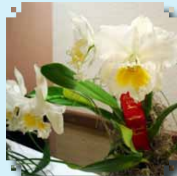
RED RIBBON C. White Diamond Gigi Louis