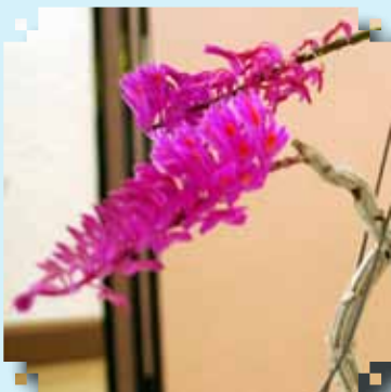
BLUE RIBBON Den secundum Tooth brush orchid Lenide Pierre-Antoine