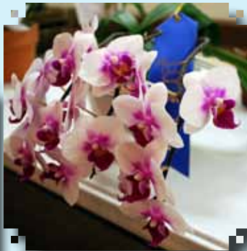
BLUE RIBBON Dtps. Fusheng's 'Gladlip' Joanne Buckley