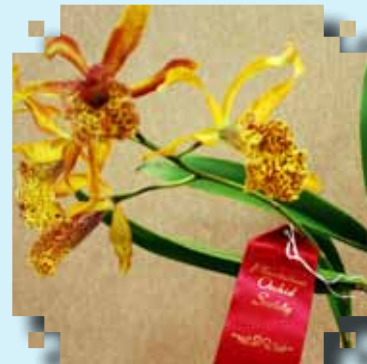
RED RIBBON Recchara Francis Fox 'Sun Spots' Beverly Warde

As a reminder, all plants brought in for the show table should be free of pests and diseases. Take some time to stake and clean the leaves of your plants, this allows for better presentation. Also, please do not bring newly-purchased plants for the show table. The show table is an outlet for members to share the great job they have done in growing and flowering their orchids; therefore, please respect the unwritten rule of owning and growing an orchid for a minimum of 6 months.