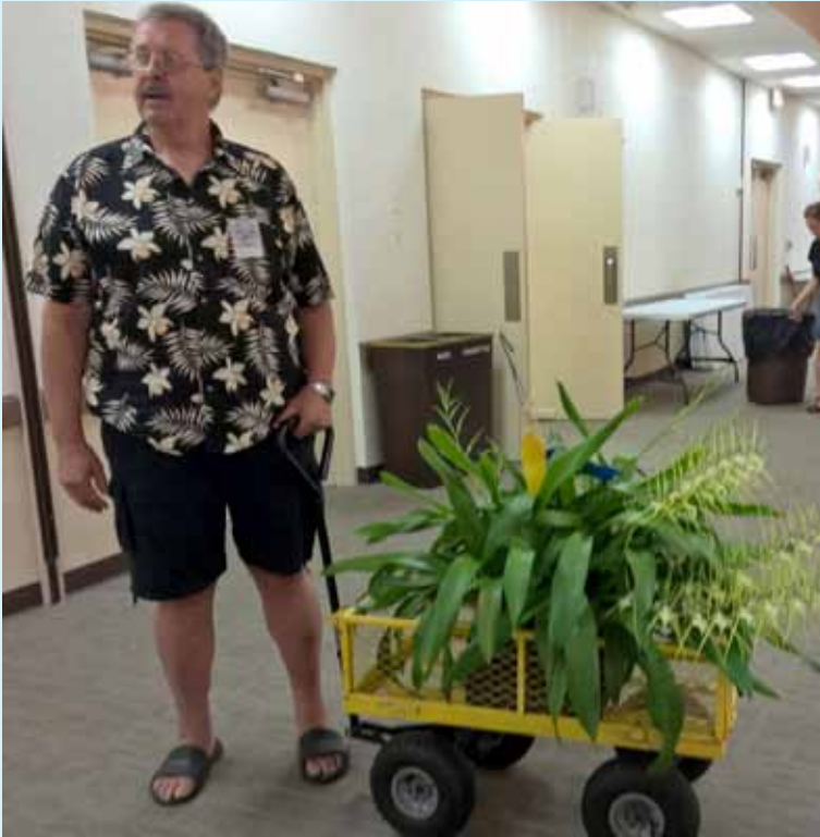
So big it needed a wagon!