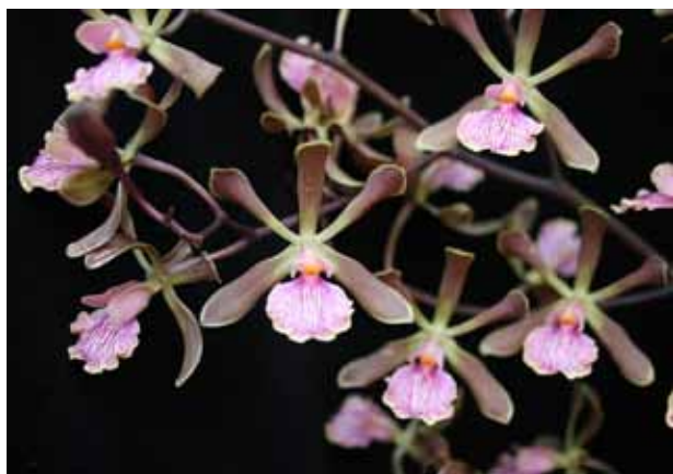
Our 2014 Photo Winner - Lynn Molitor

Guillermo said that minis are often used in hybridizing to extract the colors. A bright orange mini can make big cattleyas bright orange. Guillermo not only likes them for their uniqueness but also the fact that he can grow 400 plants in his Miami home.