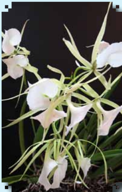
BLUE RIBBON B. Nodosa Adoraril Phyllis Durst