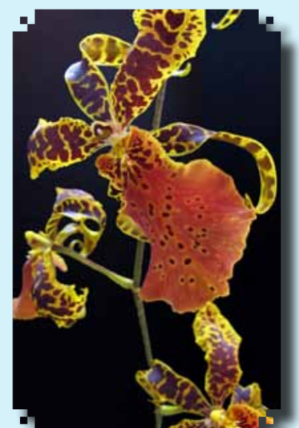
BLUE RIBBON Alcrd. Hilo Ablaze 'Hilo Gold' Tracy Moulton