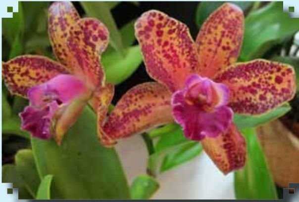
BLUE RIBBON Bc. Waiane Leopard Rose Maytin