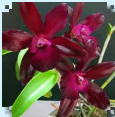
BLUE RIBBON Lc. Loog Tone 'African Beauty' HCC/AOS Helene Albee