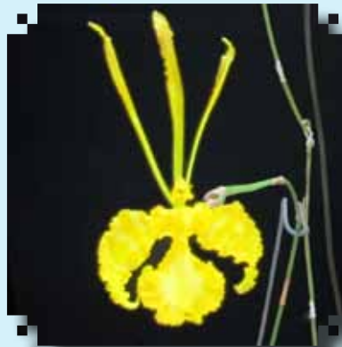
BLUE RIBBON Onc. Psychopsis Papilio v. Alba