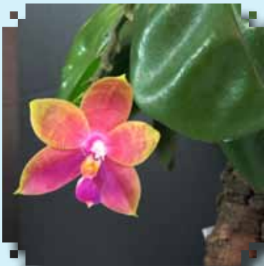
BLUE RIBBON Phal. Guadalup Camboinensis 'Nashville' x bellina 'Orchid Classic' AM/AOS Gigi Louis