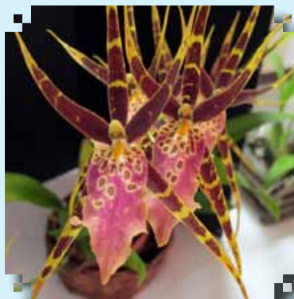
BLUE RIBBON Miltassia 'Shelob' Lynn Molitor