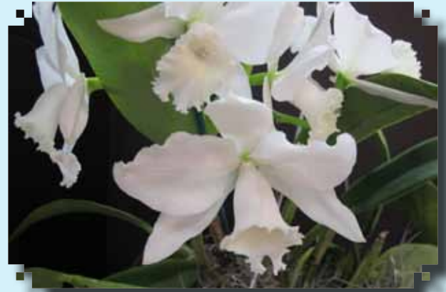
BLUE RIBBON C. Hawaiian Wedding Song Suzie Bleus