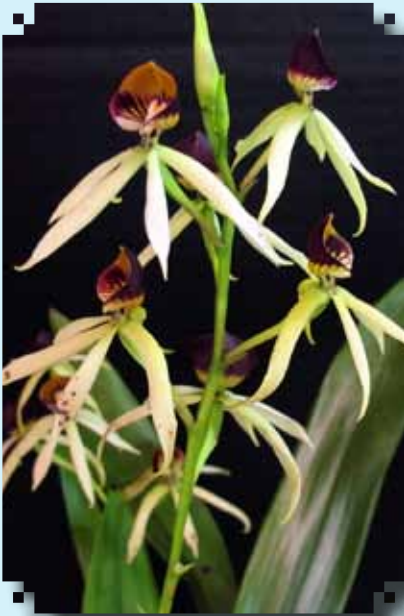
BLUE RIBBON Species cochleatum lamcifoium Rose Maytin