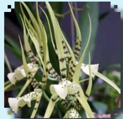
RED RIBBON Brassia Sunrise Glow Lynn Molitor

As a reminder, all plants brought in for the show table should be free of pests and diseases. Take some time to stake and clean the leaves of your plants, this allows for better presentation. Also, please do not bring newly-purchased plants for the show table. The show table is an outlet for members to share the great job they have done in growing and flowering their orchids; therefore, please respect the unwritten rule of owning and growing an orchid for a minimum of 6 months.