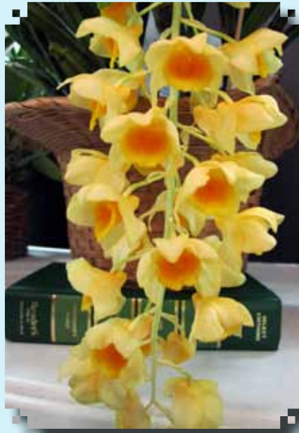
BLUE RIBBON Den. denisforum x Den. griffitnium Elise Chapman