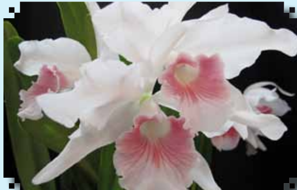
BLUE RIBBON L. Purpurata 'Carnea' Phyllis Durst