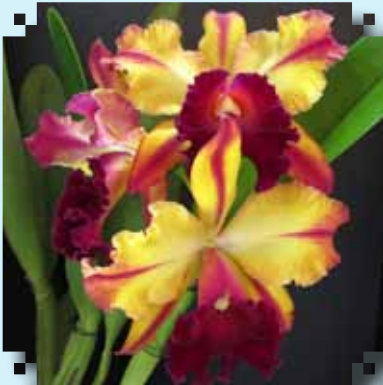
BLUE RIBBON Blc. Taiwan Gold 'Golden Oriole' Gigi Louis