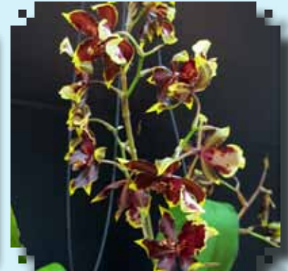
BLUE RIBBON Ocdm. Wildcat 'Golden Red Star' Tracy Moulton