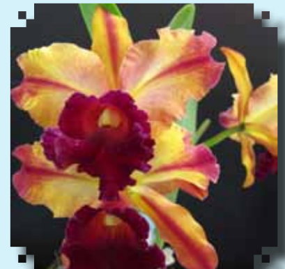
BLUE RIBBON Blc. Toshie Aoki 'Pizzaz' Joanne Buckley