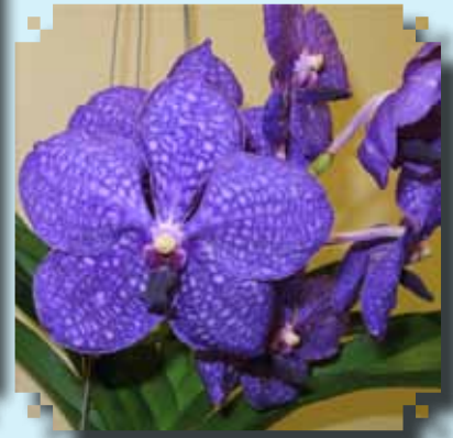
RED RIBBON V. Pachara Delight Lynn Molitor

As a reminder, all plants brought in for the show table should be free of pests and diseases. Take some time to stake and clean the leaves of your plants, this allows for better presentation. Also, please do not bring newly-purchased plants for the show table. The show table is an outlet for members to share the great job they have done in growing and flowering their orchids; therefore, please respect the unwritten rule of owning and growing an orchid for a minimum of 6 months.