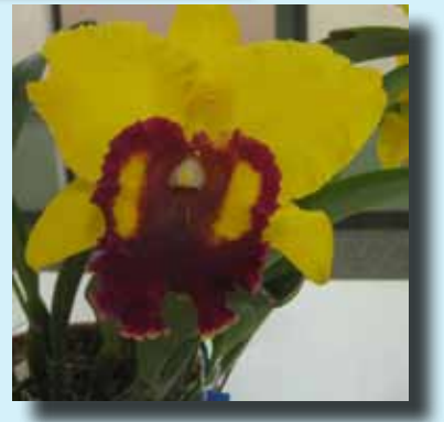
<u>BLUE</u> Phyllis Durst Blc. Willette Wong 'The Best' AM/AOS