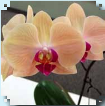
RED RIBBON Dtps. Chain Xen Queen Mary Lee Tabeling

As a reminder, all plants brought in for the show table should be free of pests and diseases. Take some time to stake and clean the leaves of your plants, this allows for better presentation. Also, please do not bring newly-purchased plants for the show table. The show table is an outlet for members to share the great job they have done in growing and flowering their orchids; therefore, please respect the unwritten rule of owning and growing an orchid for a minimum of 6 months.