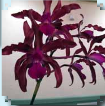
BLUE RIBBON Schomburkia Schultzii 'Old Sherry' Phyllis Durst