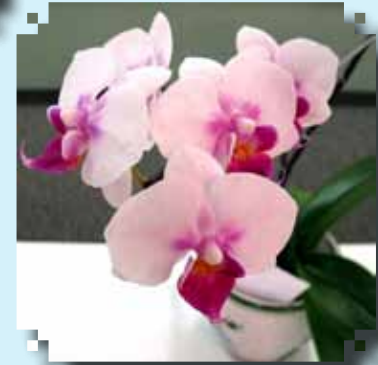
RED RIBBON Dtps. Fushings Glad Lip Mary Lee Tabeling

As a reminder, all plants brought in for the show table should be free of pests and diseases. Take some time to stake and clean the leaves of your plants, this allows for better presentation. Also, please do not bring newly-purchased plants for the show table. The show table is an outlet for members to share the great job they have done in growing and flowering their orchids; therefore, please respect the unwritten rule of owning and growing an orchid for a minimum of 6 months.