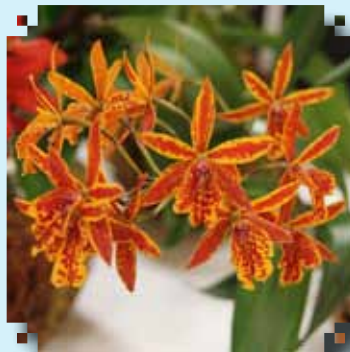
BLUE RIBBON Eplc Volcano Trick Paradise Tom Van Strander