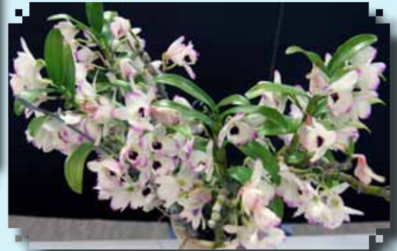
BLUE RIBBON Den. Love Memory Fizz Rose Maytin