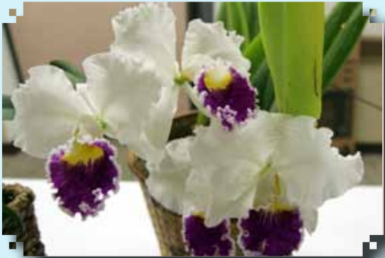
BLUE RIBBON C. Mildred Rives "Orglades" Phyllis Durst