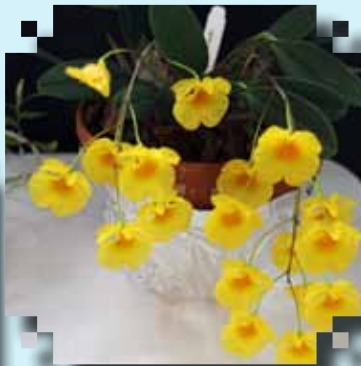
RED RIBBON Den. aggregatum Trevor Cha Camp