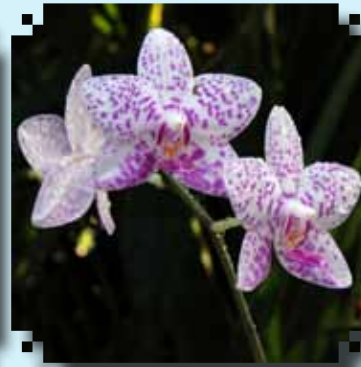
RED RIBBON Phal. Pine Hill Fireworks Mary Lee Tabelaing

As a reminder, all plants brought in for the show table should be free of pests and diseases. Take some time to stake and clean the leaves of your plants, this allows for better presentation. Also, please do not bring newly-purchased plants for the show table. The show table is an outlet for members to share the great job they have done in growing and flowering their orchids; therefore, please respect the unwritten rule of owning and growing an orchid for a minimum of 6 months.