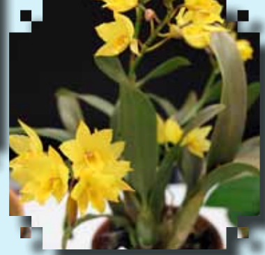
RED RIBBON Cat. Iwan Apple Blossom Golden Elf Dot McCrain