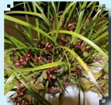
BLUE RIBBON Maxillaria tenuifolia Rose Maytin