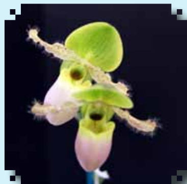
BLUE RIBBON Paph. Pinocchio Jeff Tucker