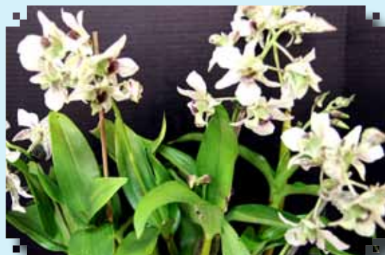
BLUE RIBBON Den. Roy Tokunaga x Den. Roy Tokunaga 'Spots' Phyllis Durst