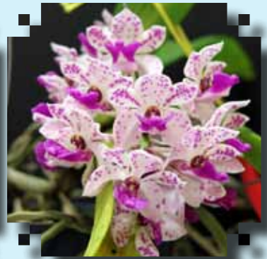
RED RIBBON Rhy. Gigantea 'Red' x 'Spots' Karen Reynoldson

As a reminder, all plants brought in for the show table should be free of pests and diseases. Take some time to stake and clean the leaves of your plants, this allows for better presentation. Also, please do not bring newly-purchased plants for the show table. The show table is an outlet for members to share the great job they have done in growing and flowering their orchids; therefore, please respect the unwritten rule of owning and growing an orchid for a minimum of 6 months.