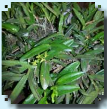
YELLOW RIBBON Epi. rigidum Bob Beckoff