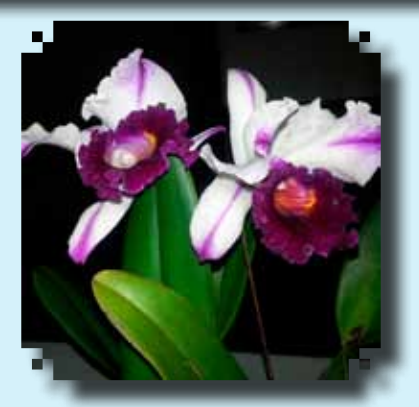
RED RIBBON Blc. Kuwale Gem Phyllis Durst