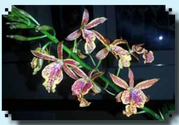
<u>BLUE RIBBON</u> Eplc. Volcano Trick "Paradise" Tom Van Strander