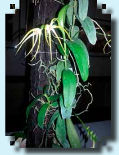
<u>BLUE RIBBON</u> <u>YERLLOW RIBBON</u> Thrixspermum Elongatum Joan Viggiani