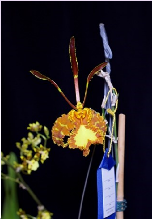
BLUE RIBBON Psychopsis Lynn Molitor