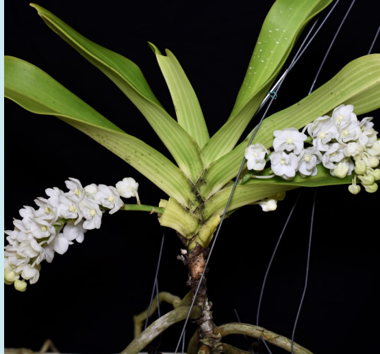
Rhy. Gigantea 'Alba' - Phyllis Durst Blue Ribbon