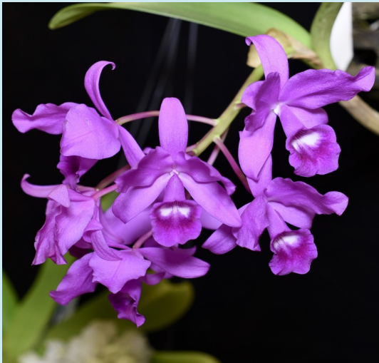
Cattleya Hail Storm - Elise Chapman Red Ribbon